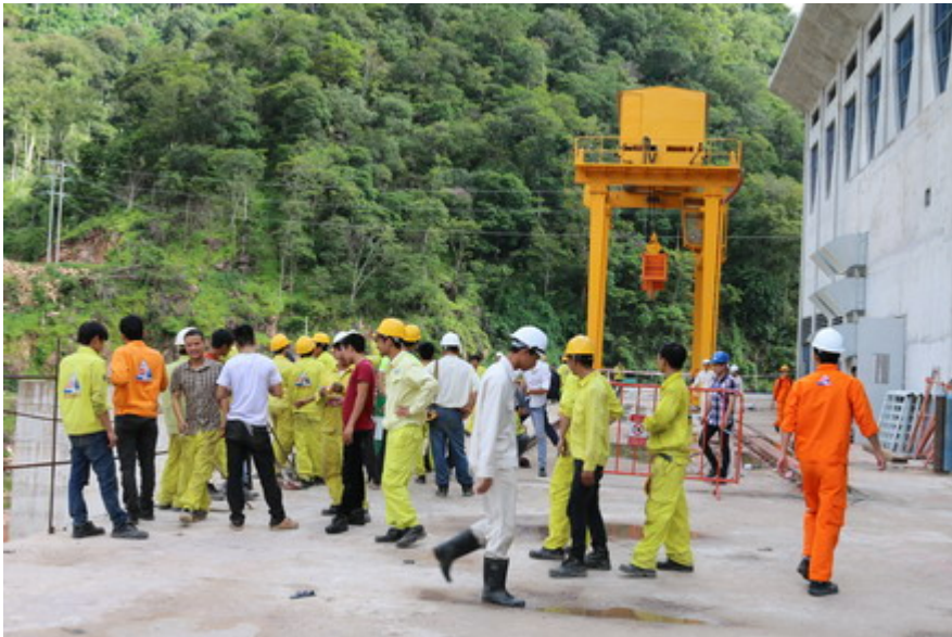
Staffs and official express delight at operation of Unit 1

Unit 1 of Xekaman 1 Hydropower Plant has design capacity of 145MW out of 326MW of Xekaman 1 HPP. All the electro-mechanical equipments of Xekaman 1 Hydropower Plant (290MW) and Xekaman XanXay (36MW) are supplied by ANDRITZ Hydro from Austria – one of the leading electro – mechanical supplier in the world.