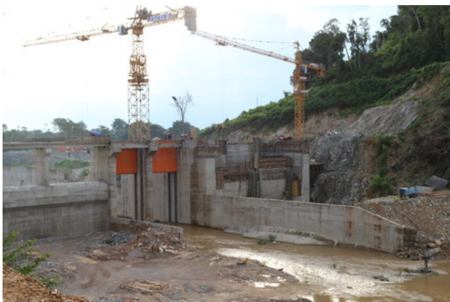
Xekaman XanXay HPP