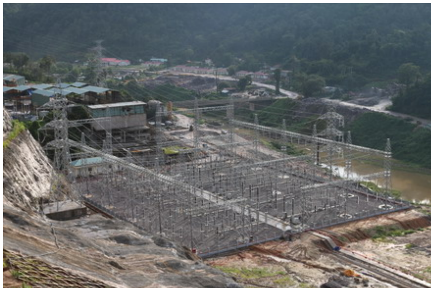
230kV switchyard – Xekaman 1 Hydropower Project

Almost 90% of power output of Xekaman 1 HPP shall be supplied to Vietnam’s Grid via Xekaman 1-Pleiku 2 transmission system. Furthermore, 230kV switchyard also functions to deliver power of other HPPs in the South of Laos to VietNam when operational.