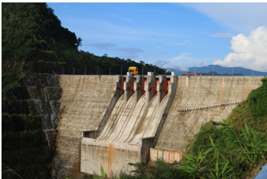
Damsite of Xekaman 1 HPP from downstream view